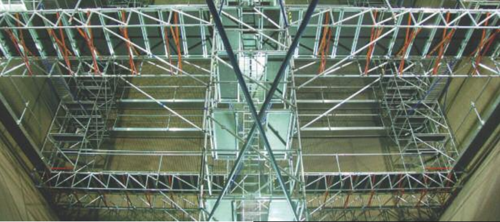
Above: Manjung Boiler Access System, Malaysia 660MW unit commissioned in November 2007. View looking from the bottom of the hopper showing base trusses and upper structure